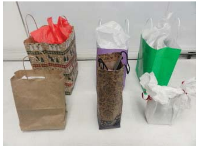
6 Raffle Prizes