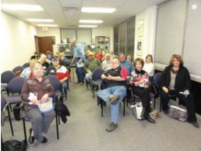
Corvette Club Members at the Meeting