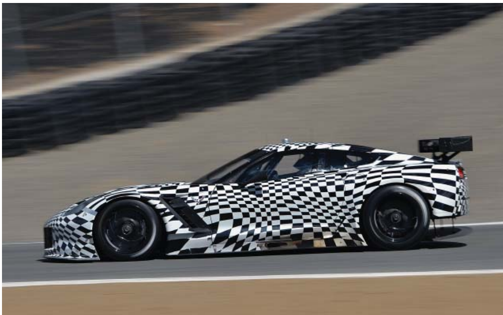
The new C7R in camouflage.